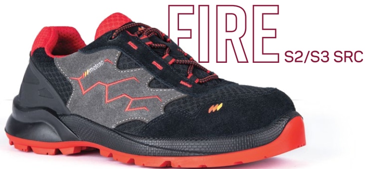
S2: E4001S S3: E4001P