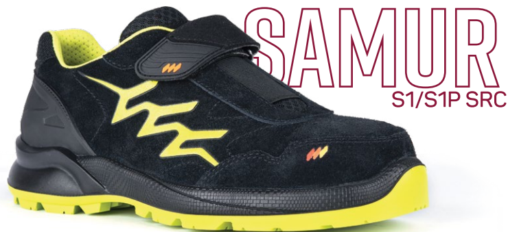
S1 : E4000S S1P : E4000P