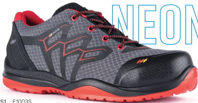
S1 : E1003S S1P: E1003P