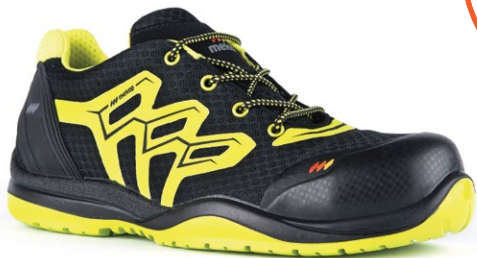
S1 : E1004S S1P: E1004P